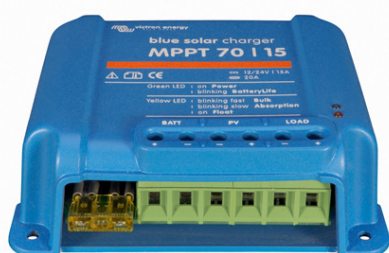
Solar charge controller MPPT 70/15